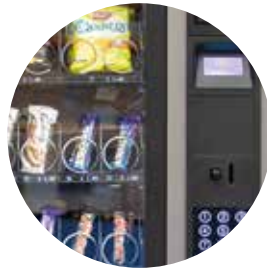
An elegant and uncluttered design